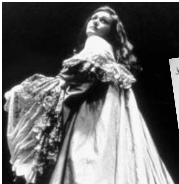
The Metropolitan Opera collection joins other opera materials in the Bywaters Special Collection at Hamon, including a photograph and letter from soprano Joan Sutherland, and Metropolitan Opera programs.